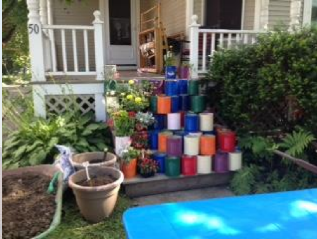
Orla Dundas - Flower Pot & Porch Project